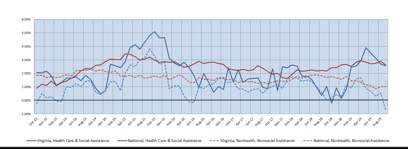
Figure 4: Six-Month Moving Average, Employment Growth, Seasonally Adjusted

Despite the strong job growth in Virginia's HC&SA sector, the six-month moving average of its employment growth rate declined for the fourth consecutive month. In September, this moving average fell from 2.68% to 2.58%. The comparable moving average for the national HC&SA sector also fell in September from 2.90% to 2.63%. Although these moving average es fell in September, they still remain far above the comparable moving averages for the total nonfarm payroll of both Virginia and the nation as a whole. The six-month moving average of the growth rate in the nation's total nonfarm payroll increased slightly from 1.00% to 1.02%. However, the same was not the case for Virginia's total nonfarm payroll. Its sixmonth employment growth rate moving average fell sharply in September from 0.53% to -0.67%.